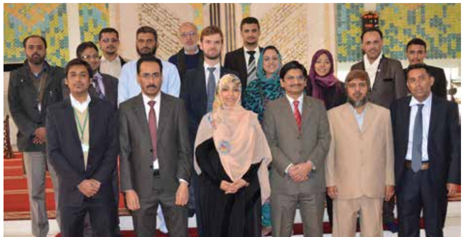
Nobel Peace Laureate Tawakkol Abdel-Salam Karman poses for a group photo with IIUI officials at the Faisal Masjid.

Nobel Peace Laureate Tawakkol Abdel-Salam Karman