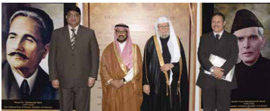
Dr Abdullah Bin Abdulmohsin Al-Turki visiting pictorial gallery of the Islamic Research Institute at the Faisal Masjid Campus of IIUI.

Scholars, researchers and academicians from Pakistan and other countries who participated in the seminar presented working papers on various aspects and perspectives of the main topic.