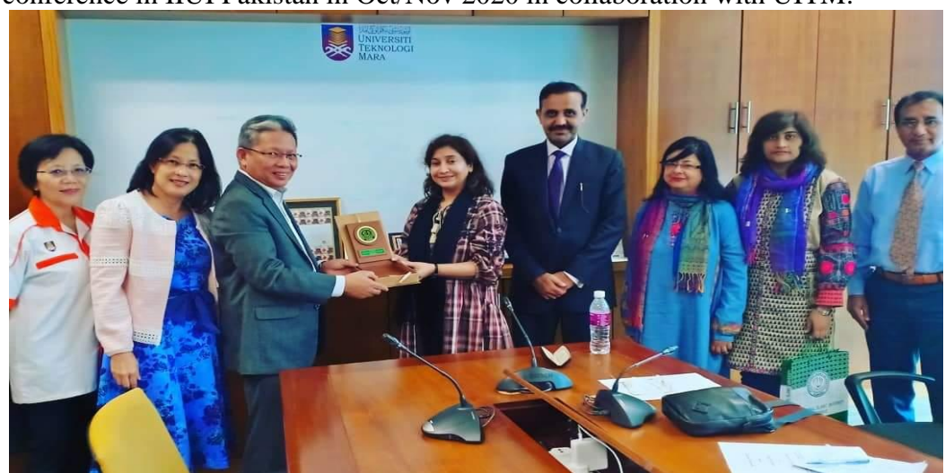
Pic: Group picture at UiTMS2, BMU at Kuching, Sarawak

On 26<sup>th</sup> August,2019 the delegation visitedUiTMS2, BMU. A meeting was held with Dy.Rector Coordinator International affairs,Director & Staff. Collaboration discussion regarding Student exchange, staff exchange, credit hour transfer, co publication took place.It was decided to have second conference in IIUI Pakistan in Oct/Nov 2020 in collaboration with UITM.