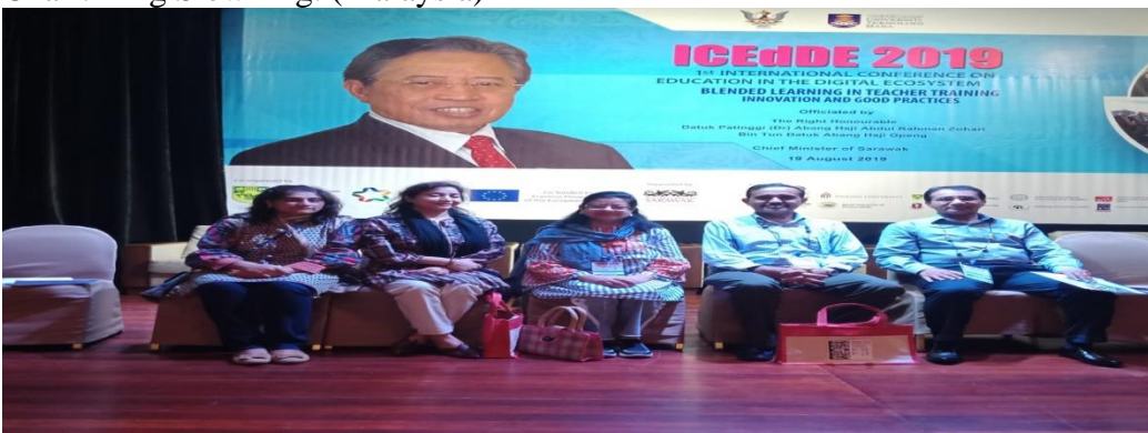
Pic: The delegation members at the conference venue