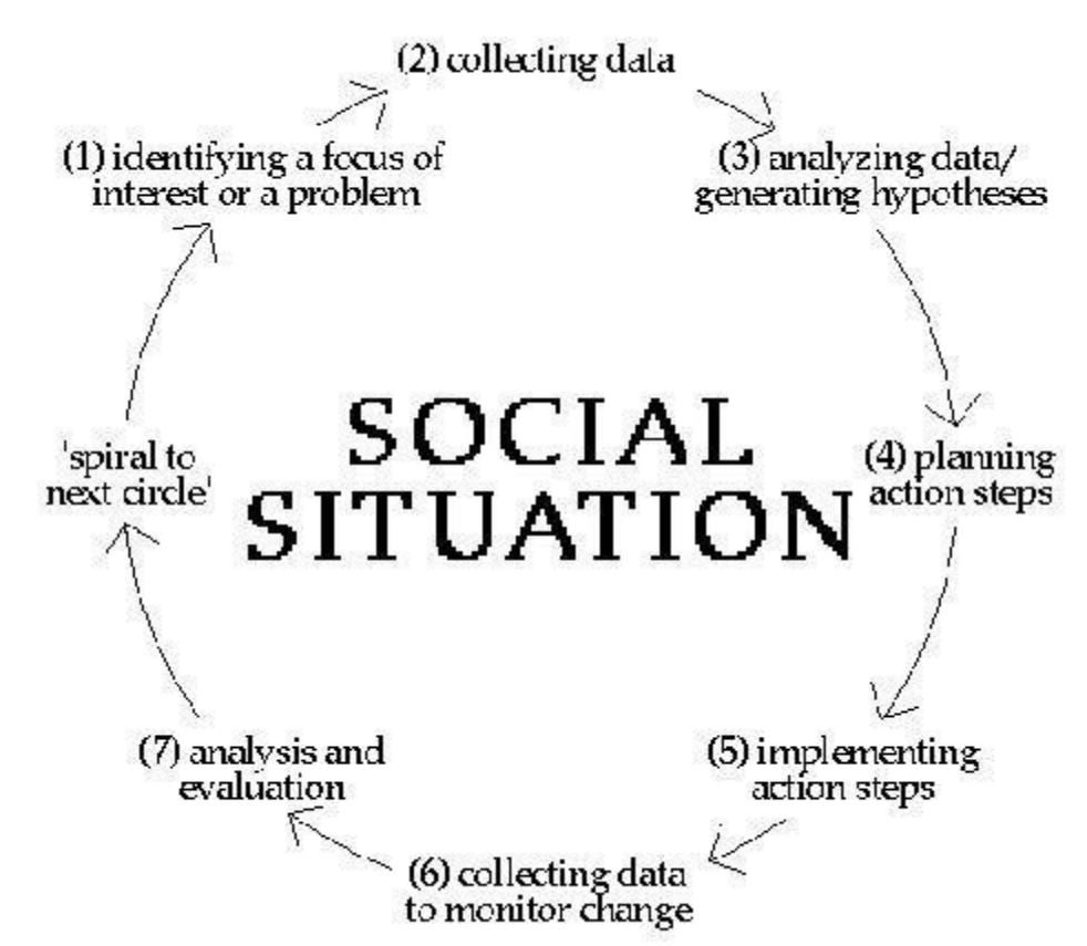
Figure 1. The seven steps in action research (McBride 1989).