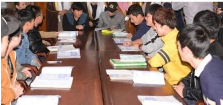
An IIU Classroom

In a creative-writing exercise the teacher moulds the story but allows plenty of scope for the students' creative expression.