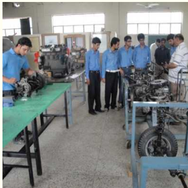
Auto & Diesel Lab