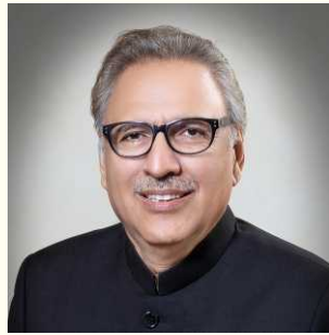
Dr Arif Alvi

To optimize integration and Islamization of the contemporary knowledge and human thought in international perspective through established institutions and academic endeavors to achieve excellence in all branches of knowledge.