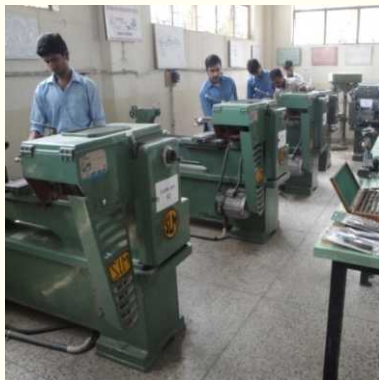
Machine Shop Lathes