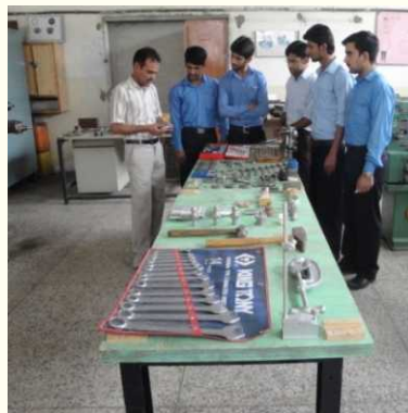
Metrology Measuring Instruments