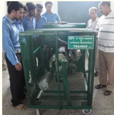
EFI Engine Trainer