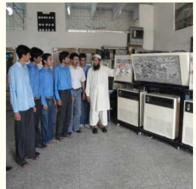
Multi Split A.C Trainer