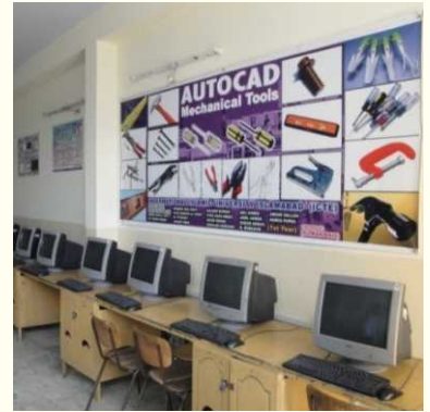
Auto CAD Lab