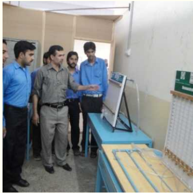
Hydraulics Lab Bends and Pipe Losses