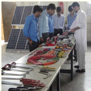
Basic Electrical Lab