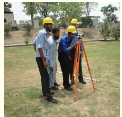
Leveling Civil Tech