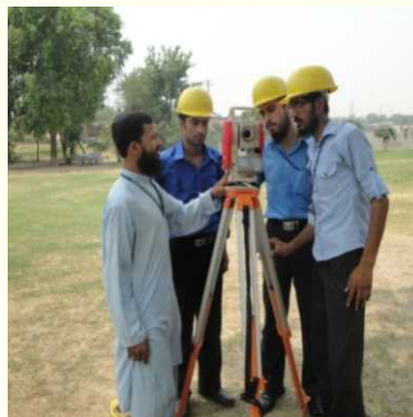
Total Station Civil Tech.