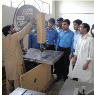
Band Saw Woodwork