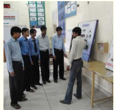
Advance Electronics Lab Trainer